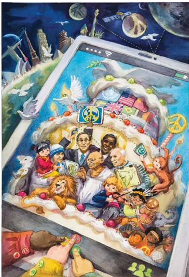
"A Celebration of Peace. "

A Celebration of peace is the theme of the 2016–2017 Peace Poster Contest. Lions Clubs can sponsor the program in their community for children in local schools or organised youth groups.